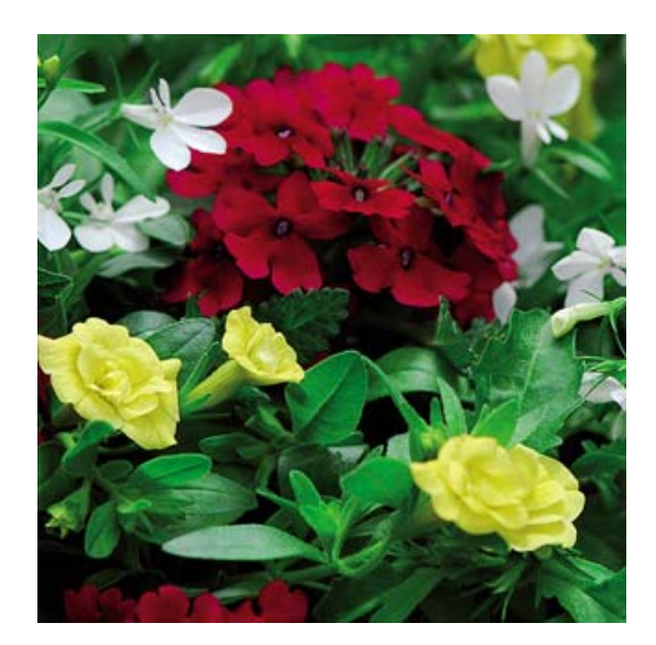
TRIXI™ 'Double Delight'