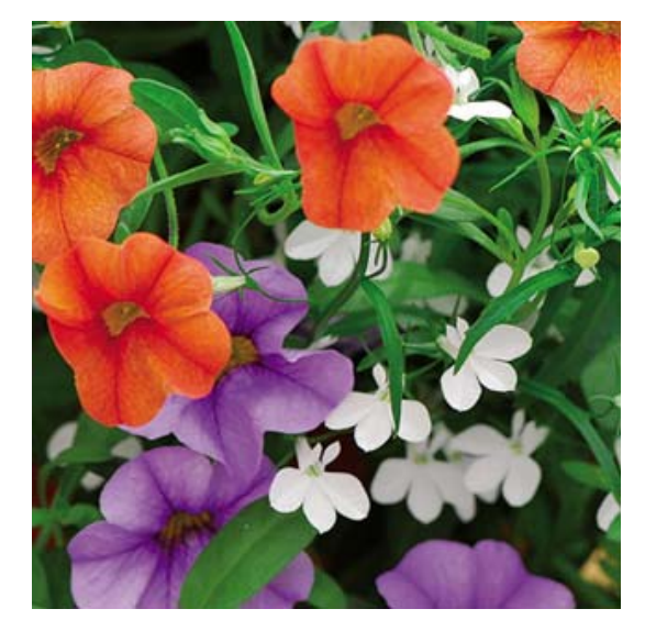
\mathsf{TRIXI}^\mathsf{TM} \text{ `Spring Valley'}