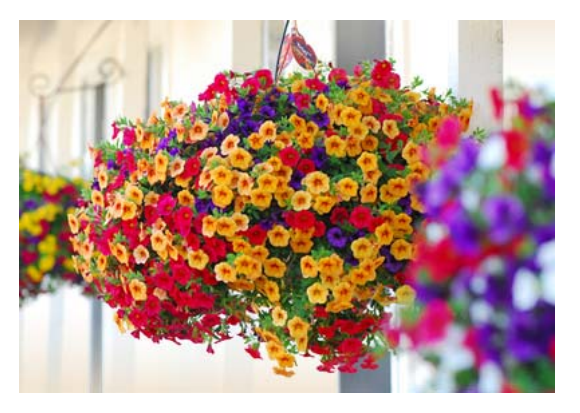
TRIXI™ 'Carribbean Cocktail'