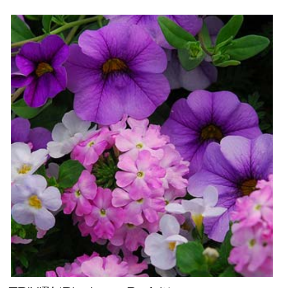
TRIXI™ 'Blueberry Parfait'