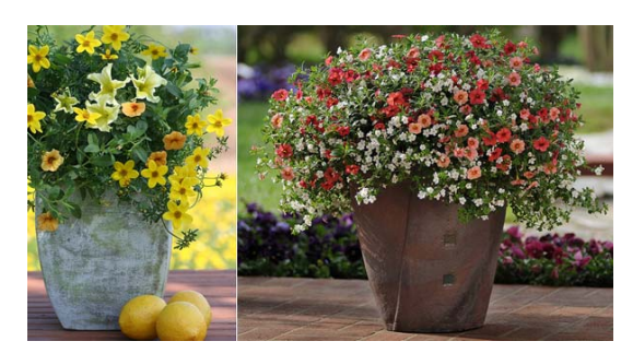
\mathsf{TRIXI^{TM}} 'Lemon Sorbet' (left) and \mathsf{Trixi^{TM}} 'Melon' Sorbet' (right)