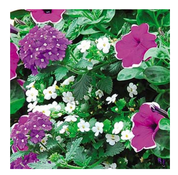
\mathsf{TRIXI}^\mathsf{TM} 'Purple Heart'