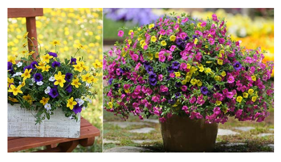
\mathsf{TRIXI^{TM}} 'Twinkle Star' (left) and \mathsf{Trixi^{TM}} 'Lollipop' (right)