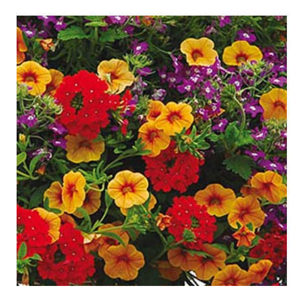
TRIXI™ 'Ayers Rock'