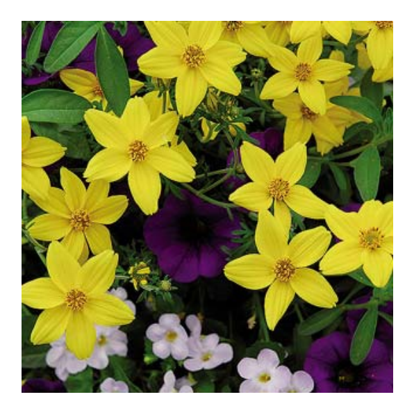
TRIXI™ 'Twinkle Star'