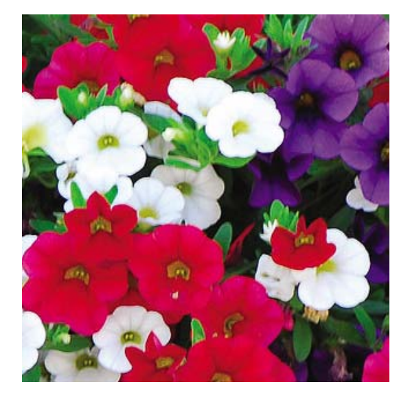
TRIXI™ 'Old Glory'