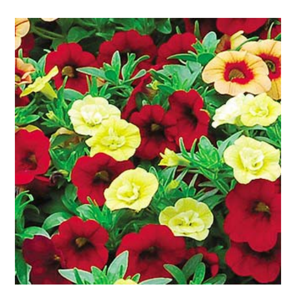
TRIXI™ 'Tequila Sunrise'