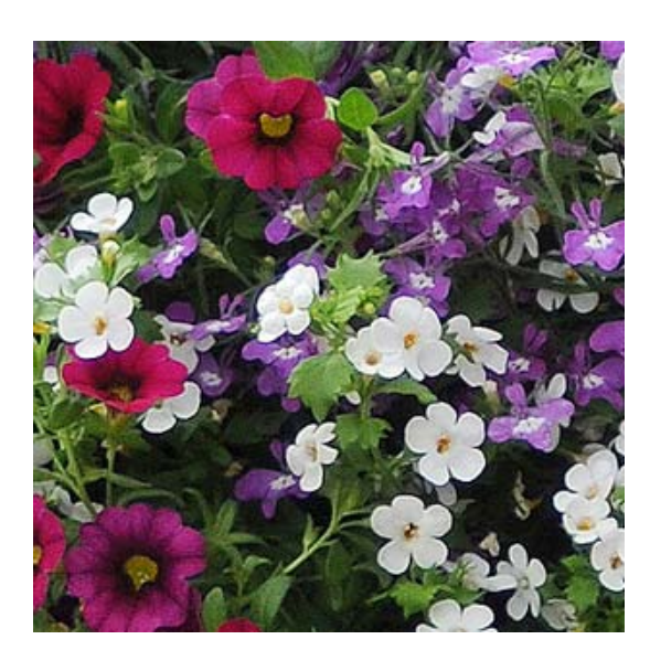
TRIXI™ 'Paso Doble'