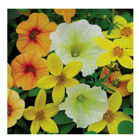
TRIXI™ 'Lemon Sorbet'