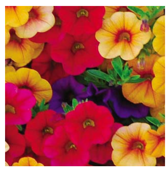
TRIXI™ 'Caribbean Cocktail'