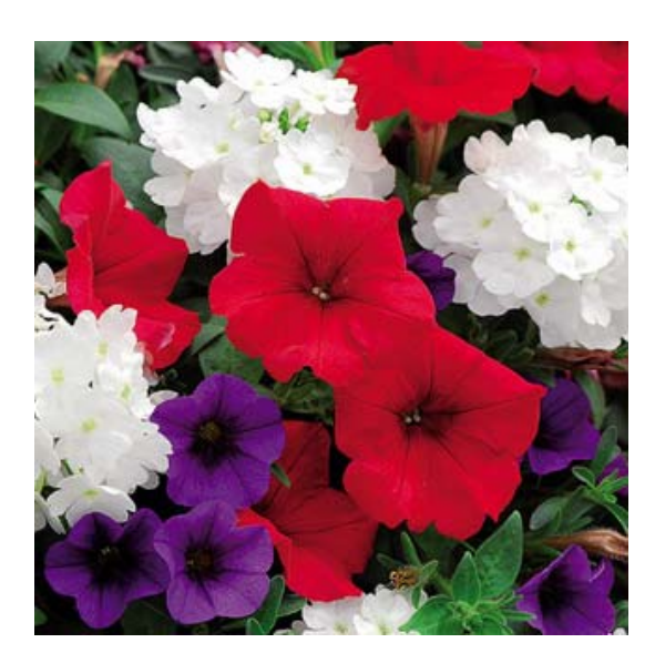
TRIXI™ 'Liberty Bell'