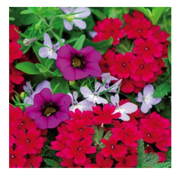
\mathsf{TRIXI}^\mathsf{TM} 'Berry Fields'