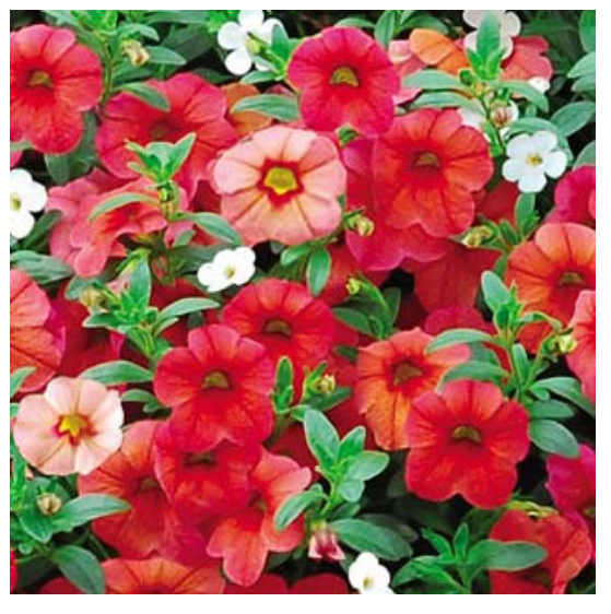
TRIXI™ 'Melon Sorbet'