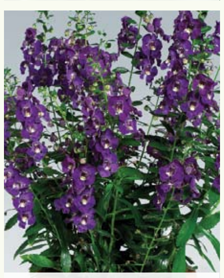
PAC ADESSA Deep Blue