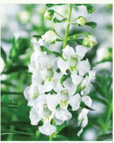
PAC ADESSA White

TRAY SIZE:102/100MINIMUM:1 box/4 traysAll items subject to availability.