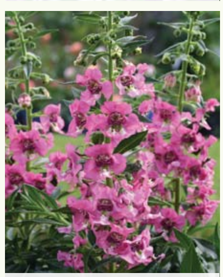
PAC ADESSA Pink