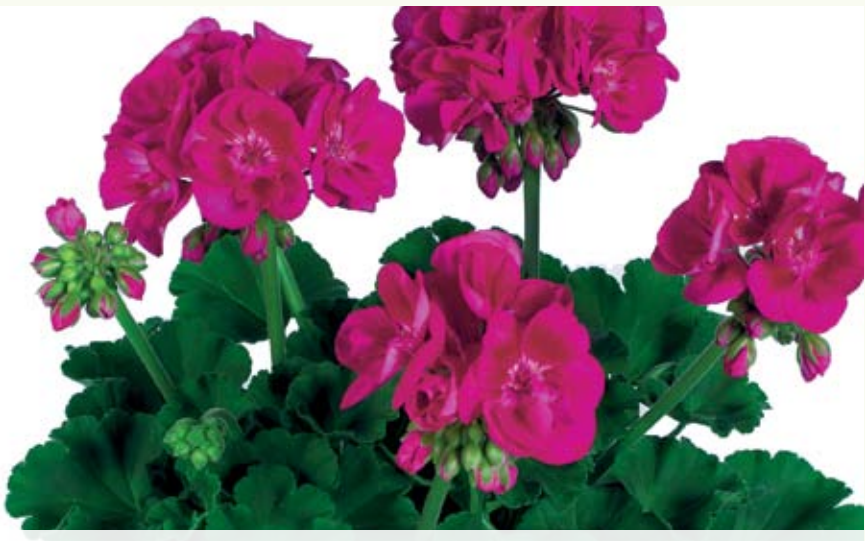
FLOWER FAIRY Berry

TRAY SIZE: 104/104, 8 x 13 strip; grown in 30mm Ellepots MINIMUM: 1 box/2 trays OFFERED: Weeks 39-27 All items subject to availability.