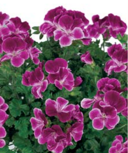
ANGEL EYES Bicolor