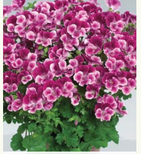
ANGEL EYES Burgundy Red