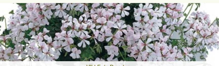
VILLE de Dresden