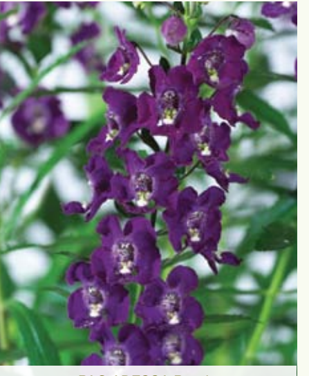
PAC ADESSA Purple