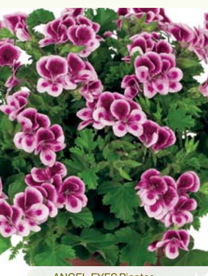
ANGEL EYES Picotee

TRAY SIZE: 104/104, 8 x 13 strip; grown in 30mm Ellepots MINIMUM: 1 box/2 trays OFFERED: Weeks 39-27 All items subject to availability.